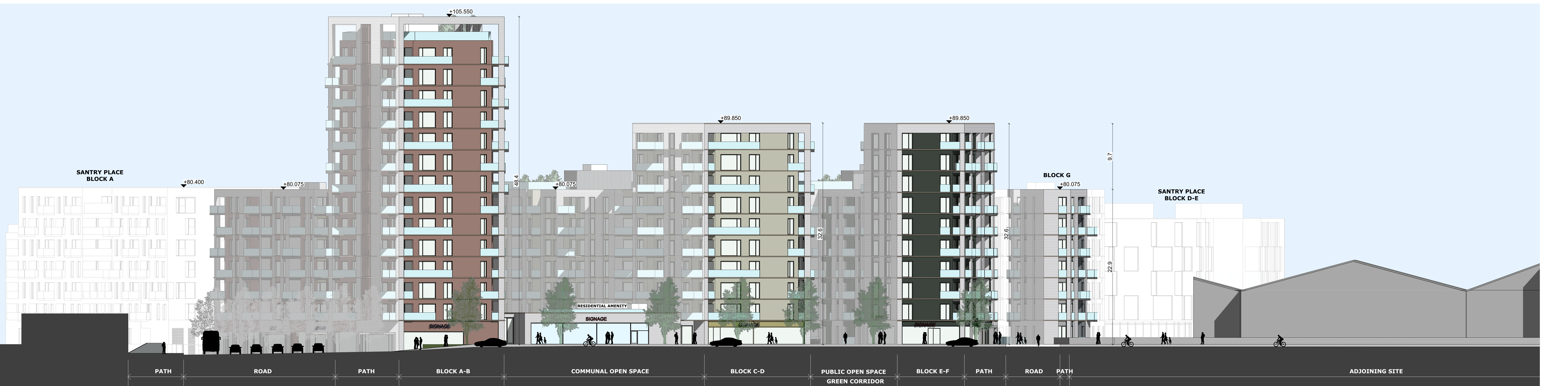
Elevation C-C Santry Avenue SCALE: 1:200