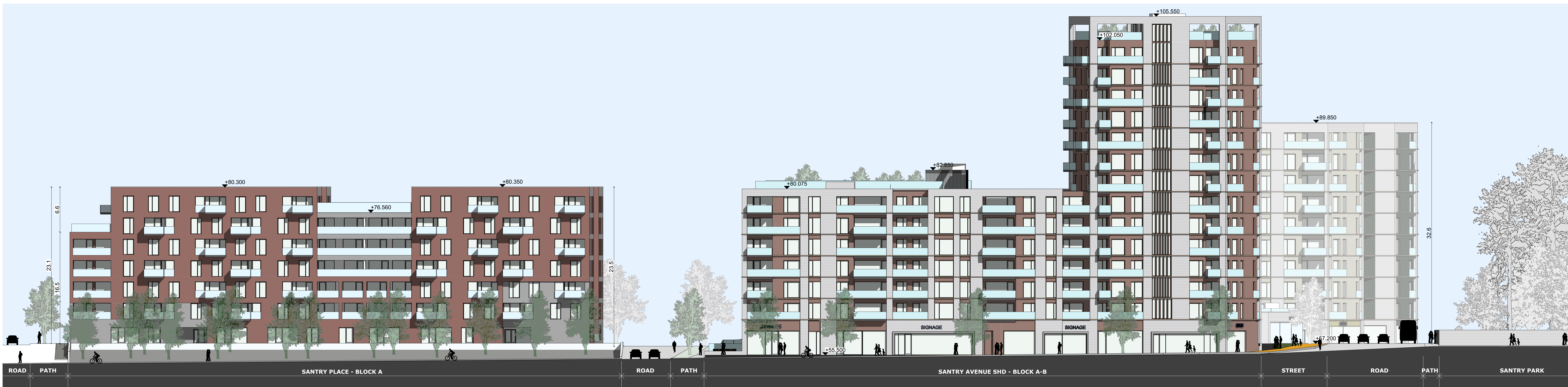
Elevation B-B Swords Road SCALE: 1:200